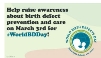
Tunu's Video Story!

World Birth Defects Day (WBDD) aims to use our collective voice in raising awareness for all birth defects and improve care and treatment (#ManyBirthDefects1Voice). This 2022 World Birth Defects Day Toolkit has been developed to help you with your awareness activities.